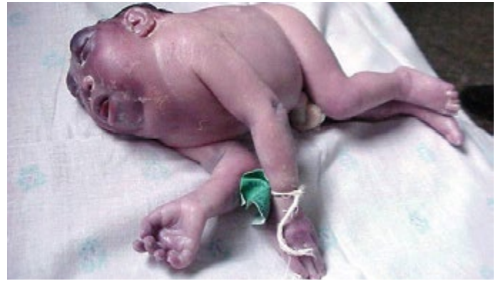
Iniencephaly as a result of radiation exposure (Photograph with permission from Dr Wladimir Wertenleki).